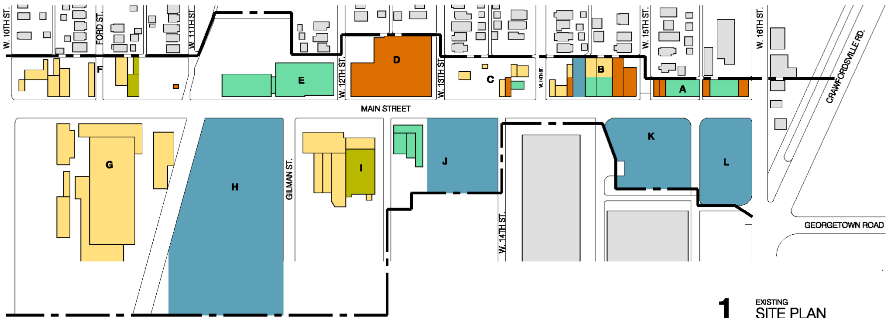
1 EXISTING SITE PLAN